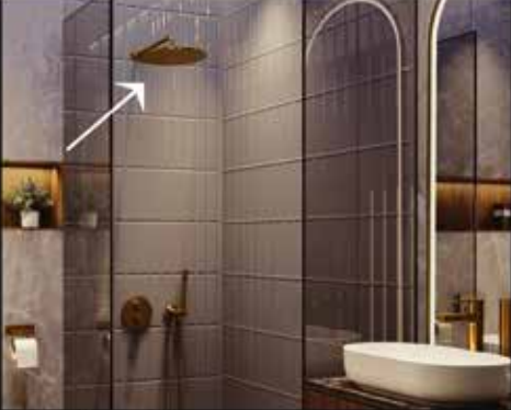
Over head Shower