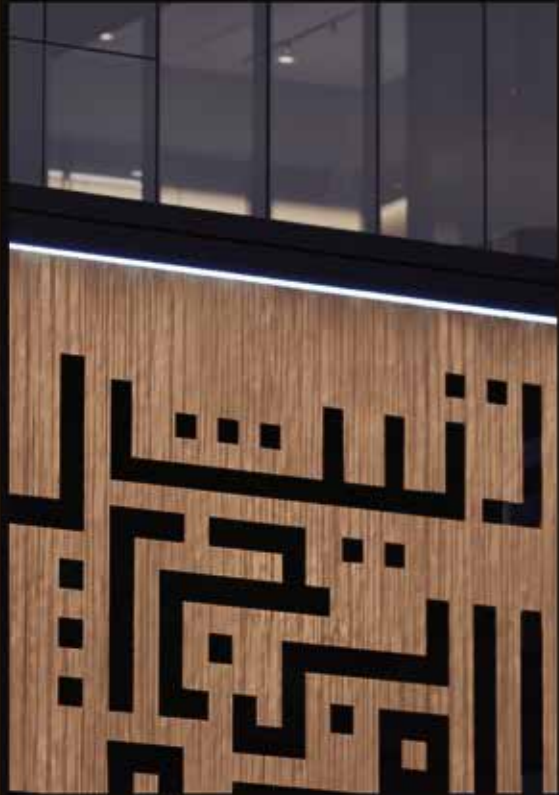
CNC Design - Brushed bronze Podium Level