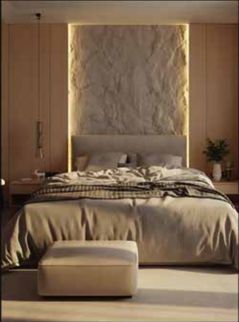
3D Textured Wall Cladding