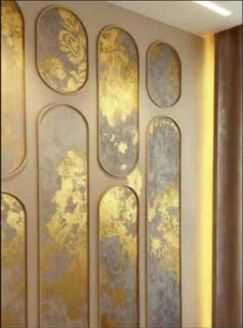
Golden Sheet & Patina