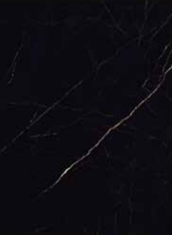
Kitchen & Corridor (Residential)