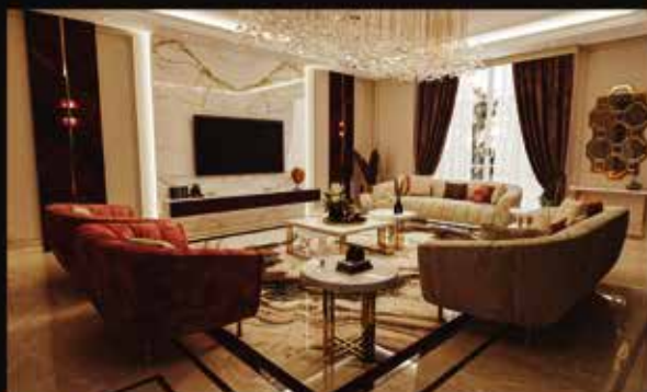
Living Room Furniture