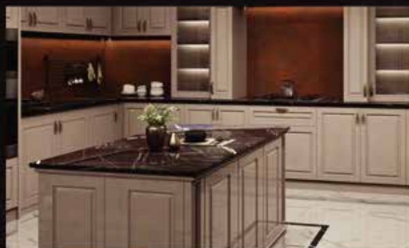
Kitchen Cabinet Set