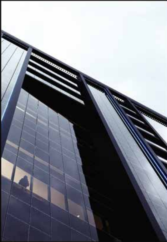
Aluminum and glass Office & Residential Level