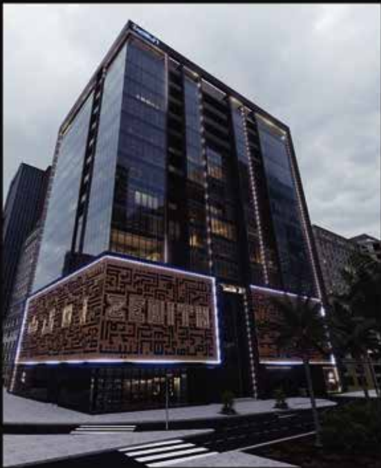
Front side view