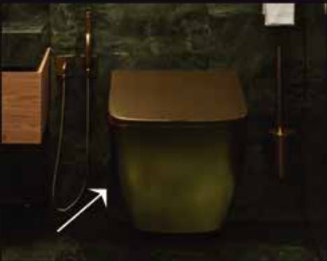
Wall Mount WC