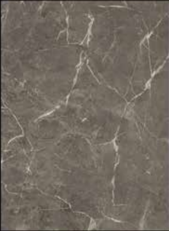
Living & Bedroom