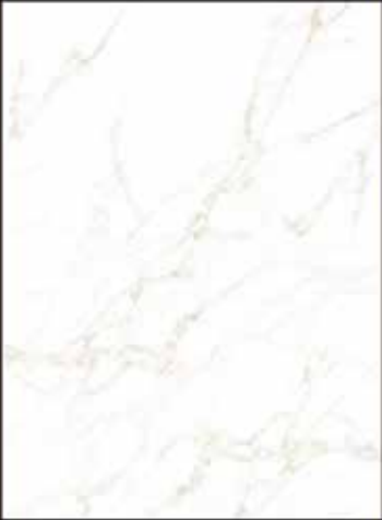
Living & Bedroom